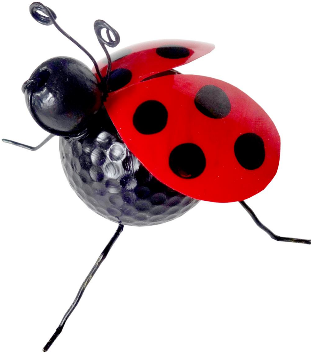
Golf Ball Ladybug