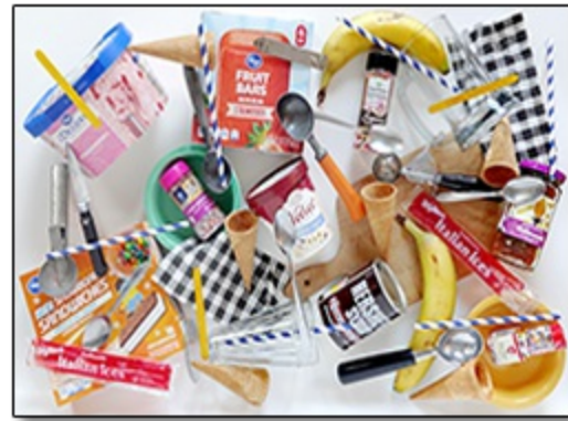
Ice Cream Detective