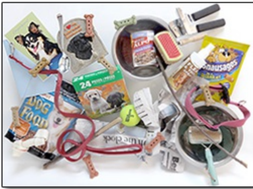
Dog Days Detective